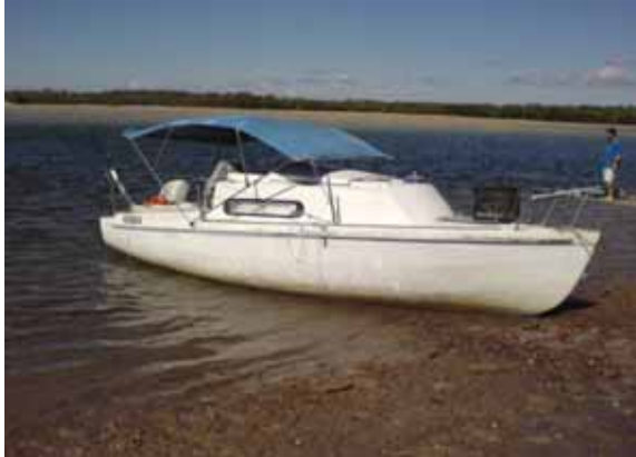
The "camper" boat