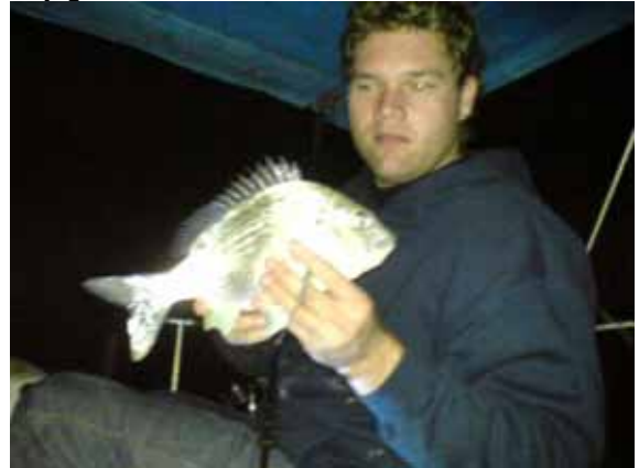
A nice bream

The next morning was spent attempting to hook up on ultralight pelagic tackle by casting and trolling around Dr Mays Island for school mackerel, tailor and pike, but apart from a few small pike and some Moses perch there didn't seem to be much happening outside of the river contrary to the reports. We'd heard of hoards of mackerel and snapper on all the reefs around the coral coast. That's fish for you - there one day gone the next.