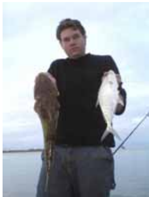
A big flatty & a queenfish

On the way to our next spot for the night, the very fishy looking Black Bank, we were bricked by what we suspect were large cod or mangrove jack. Lamenting the losses of our lures, including my favorite flatty lure (which aren't produced anymore), we made camp and relaxed by doing a spot of night fishing for sharks but with nothing around except rays & shovel-noses we turned in.