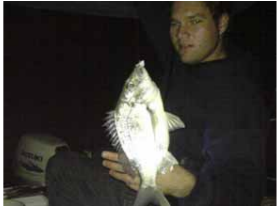
A bream for dinner

The next day we decided to troll up the river with light sport tackle, and try our luck for some big flathead and were not disappointed. Chris had tied on my favorite flatty lure, a Mann's spotted dog, while I grudgingly attached a Flatzrat. Within a short time Chris had caught 6 dusky flathead to 75cm and 3.5kgs while I had only managed 2 average ones about 60cm.