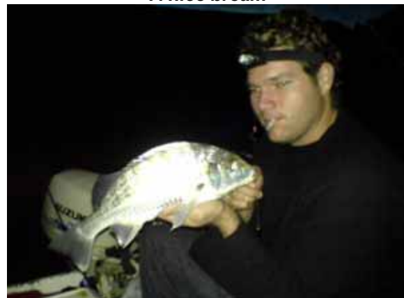
A nice grunter

Late in the afternoon with still no fish and facing tinned food for dinner we decided to try Sharks Nest again since it was firing the first night and this night turned out even better. As the darkness of night descended we stretched our lines, and our stomachs, with the resident large bream, one of which was around 40cm. As the night wore on the species of fish caught increased with some sizeable grunter (spotted javelin), nice size mangrove jack, tarwhine, whiting, perch and a couple small cod.