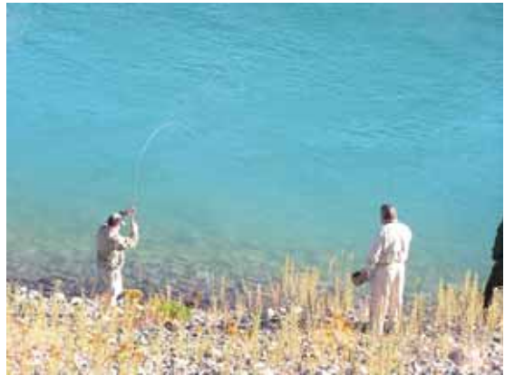
Brownie tricked a nice brownie below the power station on the Upper Tekapo