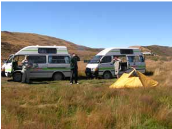
Camping at Maori Lakes