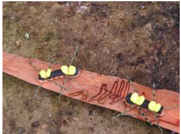
“Chernobyl Ants” – supposedly an irresistible pattern yet to be tried by the tier, Neil.

Saturday night was like Friday night, and again Vince was the only one to venture out in the morning – for the same result. The rest of only ventured into the water to retrieve our boats – as the gale force winds continued.