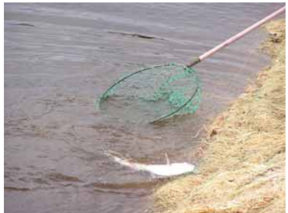
A good fish but it wasn't the biggest caught