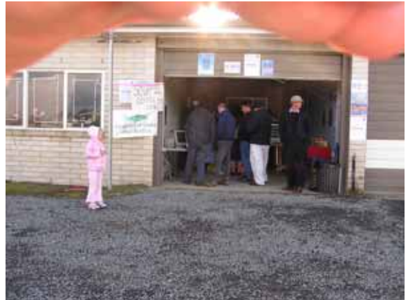
Our stall attracted many visitors. The new fish traps down towards Canal Bay