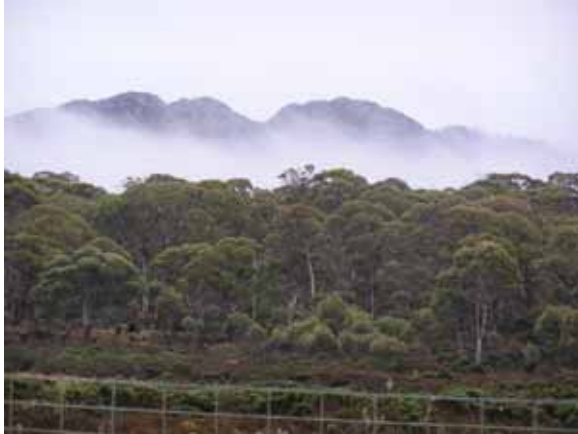
North of Liawenee the mountain range appeared to be hovering above.