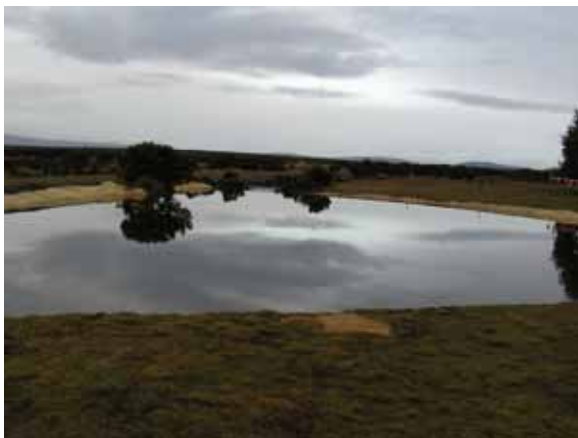
The junior's Fishing Pool was a major attraction