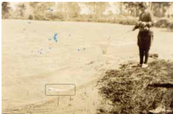
May Lewis at Blue Lake landing a nice trout