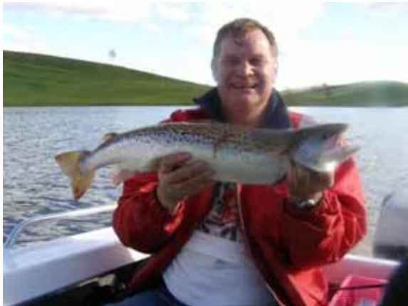
Atlantic Salmon, Craighourne, 24/10/2009. Length 67cm, weight 2.95kg uncleaned} - Rapala lure