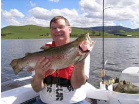
Rainbow, Craighourne Dam, 24/10/2009. Length 60cm, weight 3.47kg uncleaned} - Rapala lure