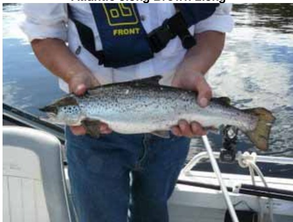
Andrew's Atlantic Salmon 500mm, 893gm cleaned