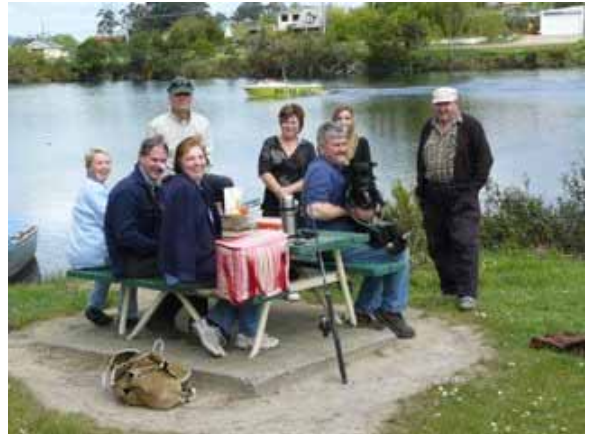
They are all smiling so they must have enjoyed themselves!