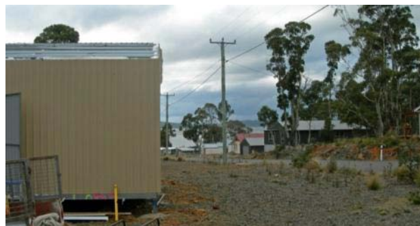
The view down the road side of the Cabin with the Lake visible through the trees

It is critical that all members pitch in.