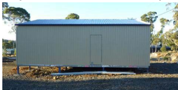
A view of the cabin from the back.

This shows the lining of the walls and the roof. You may be able to discern that there was still one section of roofing iron to go on. The building is marginally longer (about 10cm?) than originally planned due to the installation of the ceiling trusses here shown in blue, which provide structural strength as well as a frame to attach the ceiling.