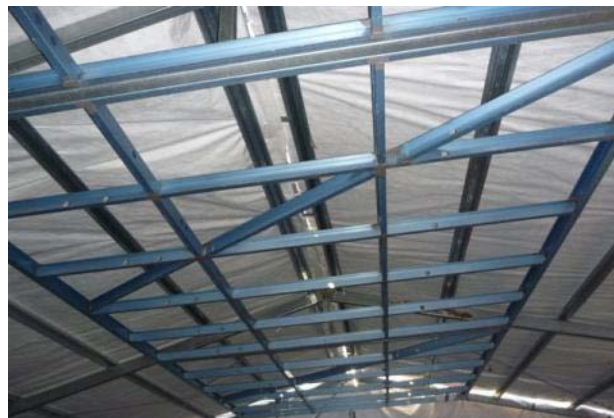
Inside view of the cabin

This picture was taken on Sunday afternoon 22nd May and shows the workmen putting on the roof after having put on the wall cladding.