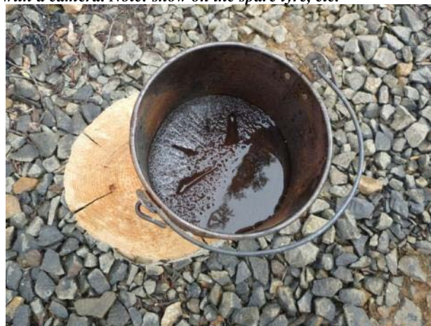
Further evidence that Sunday morning was chilly was ice in the water bucket!