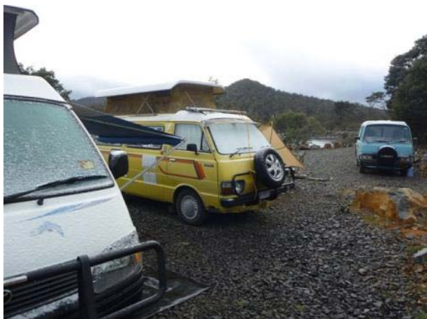
Sunday morning when Neil and Norm emerged from the respective vans, they were surprised to find snow on their vans and annexes; ....

The following are some more photos from the trip: