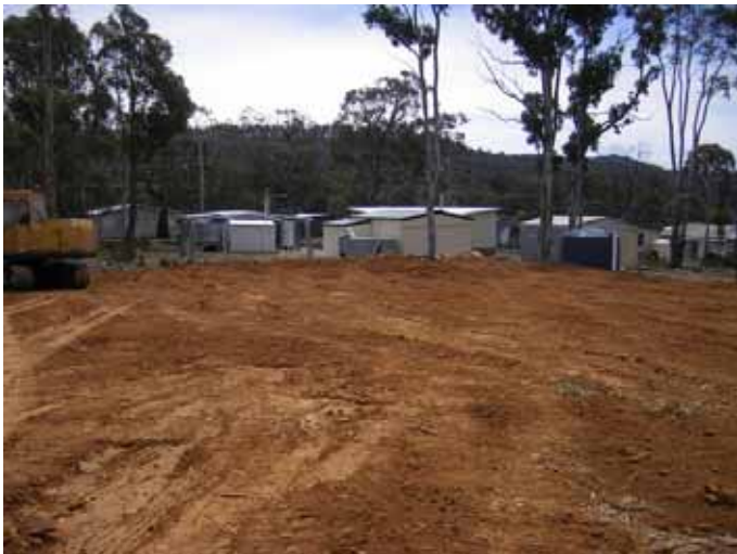
Down the middle