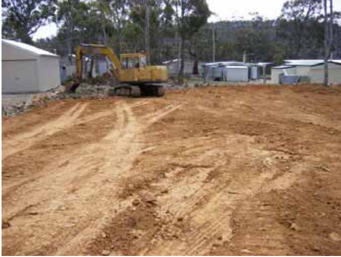
Back left corner