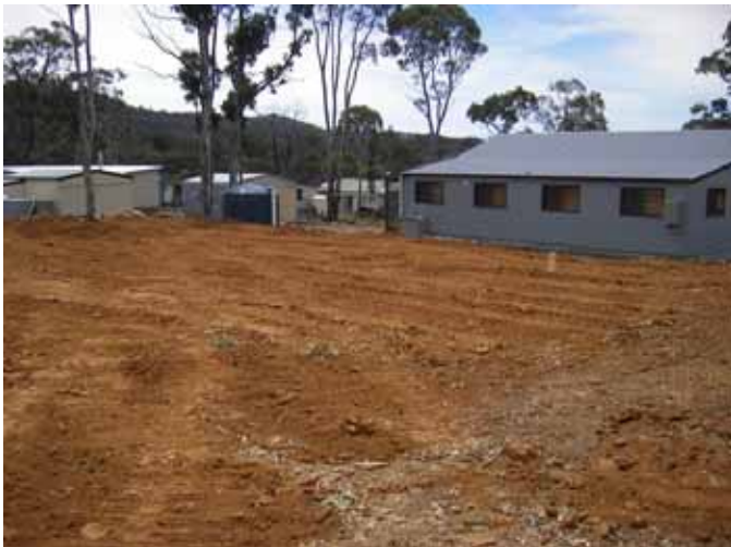
Back right corner