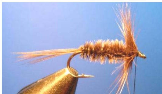
The finished fly... Ostrich Herl Dark Brown Dun

Whip finish, trim thread and apply head cement